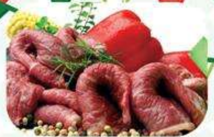
BISTEC SUAVE INSIDE ROUND