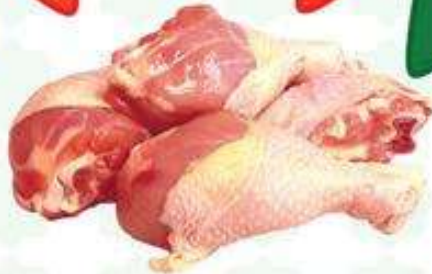
PIERNA DE POLLO CHICKEN DRUMS