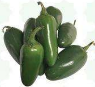
CHILE JALAPEÑO JALAPENO PEPPER