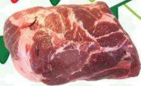
CARNE DE PUERCO PARA TAMALES BONE-IN PORK BUTT