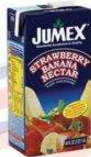
JUMEX TETRAPACK TODOS SABORES NECTARS SELECTED FLAVOURS 64 OZ