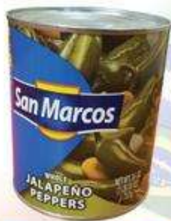
SAN MARCOS JALAPEÑOS ENTEROS WHOLE JALAPENO PEPPERS 26 OZ